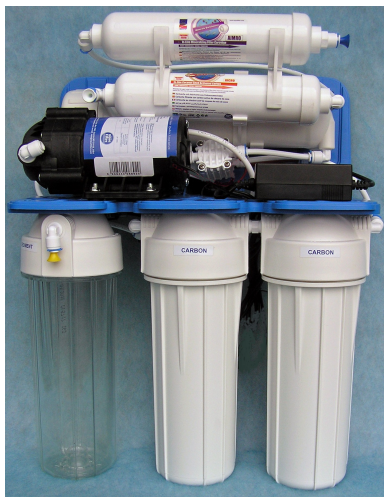
RP65139715 Reverse Osmosis