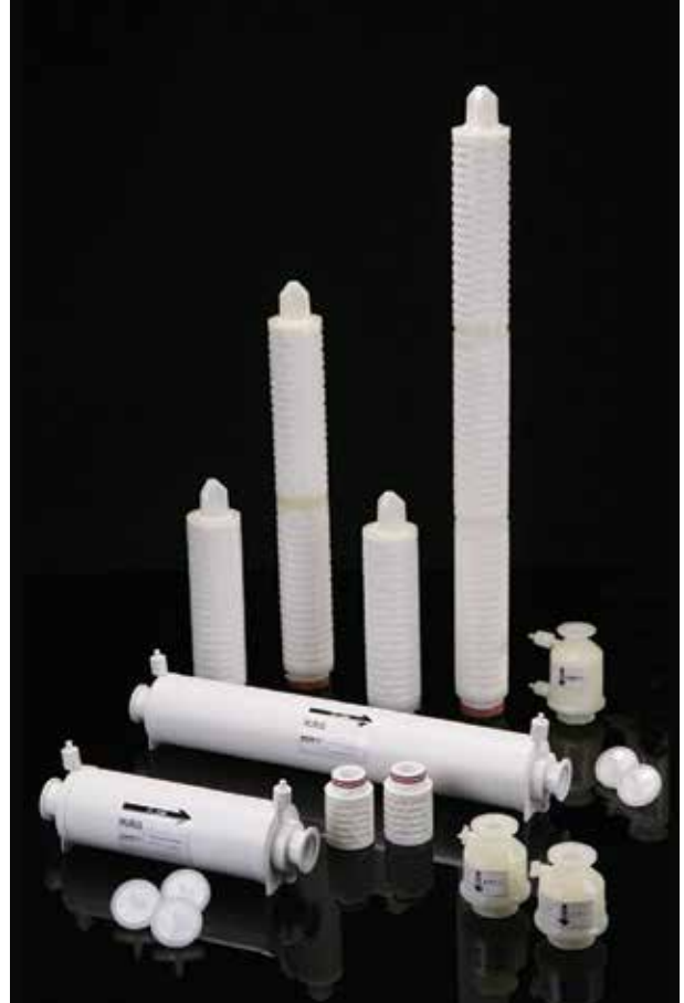
Note: TETPOR is a registered trademark of Parker Hannifin Corporation.