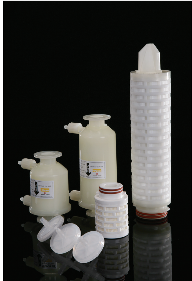
Note: PROPOR is a registered trademark of Parker domnick hunter