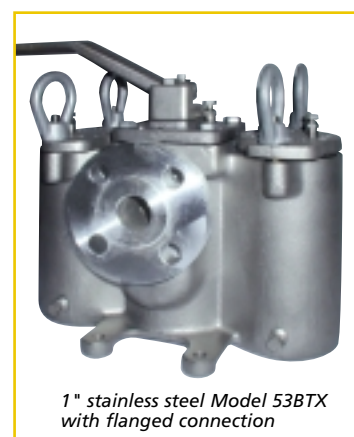
1" stainless steel Model 53BTX with flanged connection